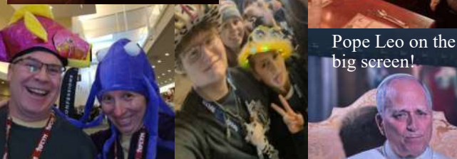
Pope Leo on the big screen!