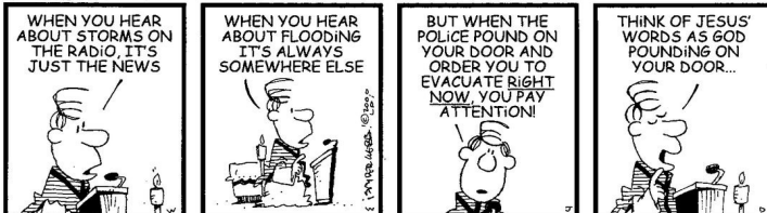
4th SUNDAY IN ORDINARY TIME

JB 7:1-4, 6-7; PS 147:1-2, 3-4, 5-6; 1 COR 9:16-19, 22-23; MK 1:29-39