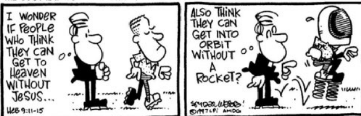
THE BODY AND BLOOD OF CHRIST