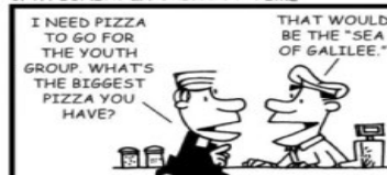
17TH SUNDAY IN ORDINARY TIME

It's easy! Text APP to 55321 or go to https://myparishapp.com/ Keep in touch with our parish with messages, parish information, bulletins, calendar, daily Mass readings, a whole list of Catholic prayers at your fingertips, Mass times, DiscoverMass (find a Catholic church while traveling), access online giving for our parish, get Catholic news, get Inspire Daily reflections on the days readings, and much more! Use the App on Sundays for the Readings and the Gospel—it's okay, you're not texting, you're praying!