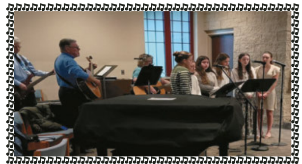
Thank you for your music ministry!

There will be one Mass only for the Holy Day “Mary, the Holy Mother of God” on Wednesday, January 1, 2025, at 8:00 AM.